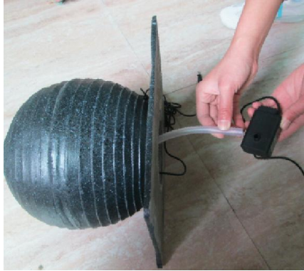
1) Connect the tube from the ball to the pump.

Locate a flat, firm surface to place your fountain. Once you have found the perfect spot for your fountain, place the base upright in the desired area.