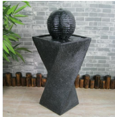
4) The final product