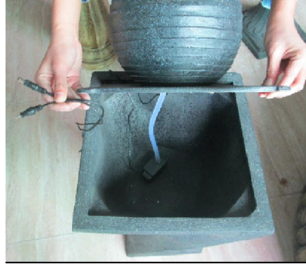
2) Put the bump on the bowl.