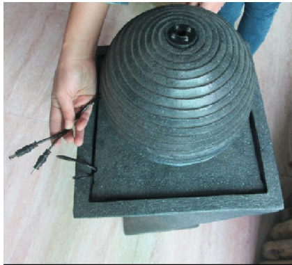
3) Put the ball on the base, the plug of LED and pump is ready.